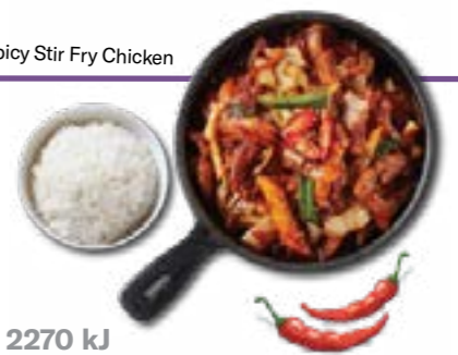
Spicy Stir Fry Chicken

Sweet potato noodles stir-fried with chicken, mushrooms and vegetables in sweet soy sauce