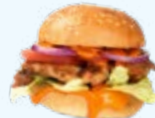
Pan-Cooked Chicken Burger