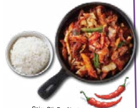
Spicy Stir Fry Chicken