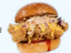
Gami Chicken Burger