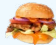
Pan-Cooked Chicken Burger