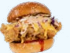
Gami Chicken Burger