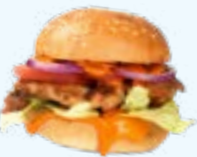
Pan-Cooked Chicken Burger