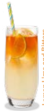
Lemon Lime and Bitters