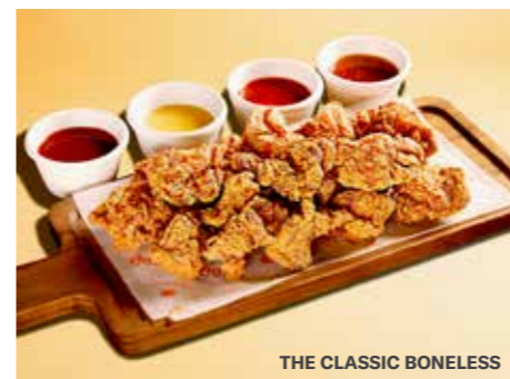
THE CLASSIC BONELESS