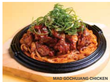
MAD GOCHUJANG CHICKEN